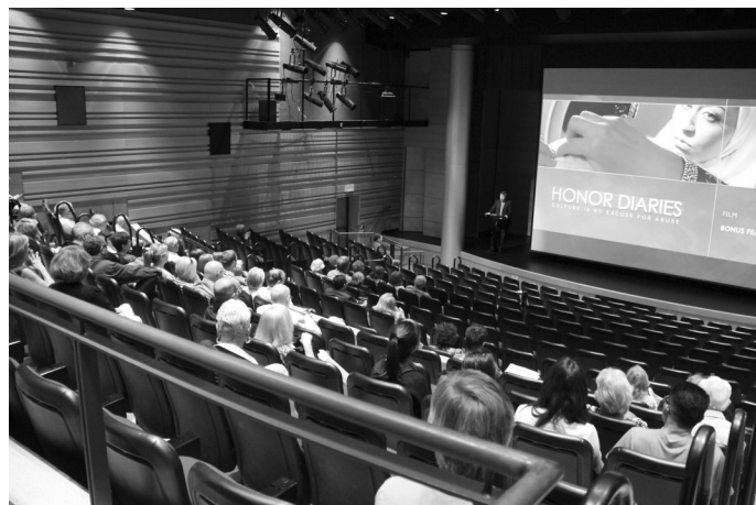
ABOVE: Paul McKeever addresses the audience in the cavernous Wolfe Auditorium in downtown London, prior to the screening of Honor Diaries .

The London screening kicked off with an opening address by Freedom Party leader Paul McKeever, followed by a showing of the documentary