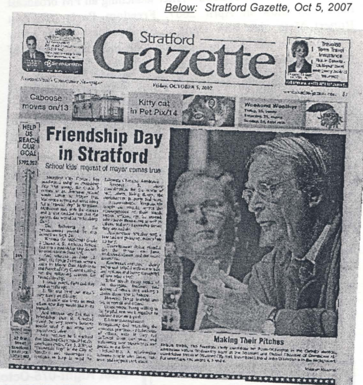
CANDIDATES: more coverage on pg 11

pages of the Stratford Gazette . Inside, the paper devoted extensive space to each of the candidates' positions. {CANDIDATES... continued on pg 11 }